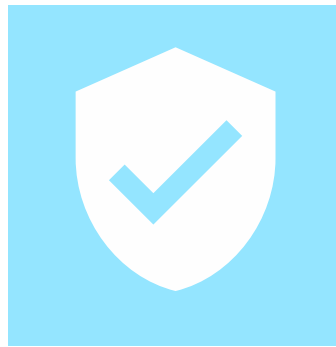
Insurance protection (optional)