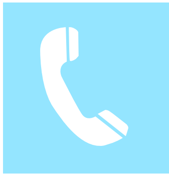
Unlimited telephone advice

Once you have HR Key in place you can be confident that your business is compliant, and our annual audit guarantees that you're never caught out! With these processes in place, you can focus on other aspects of your business.