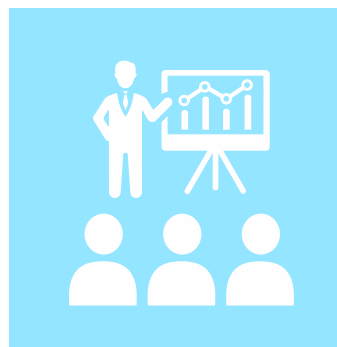
Free seminars & webinars