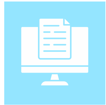
Over 100 online documents